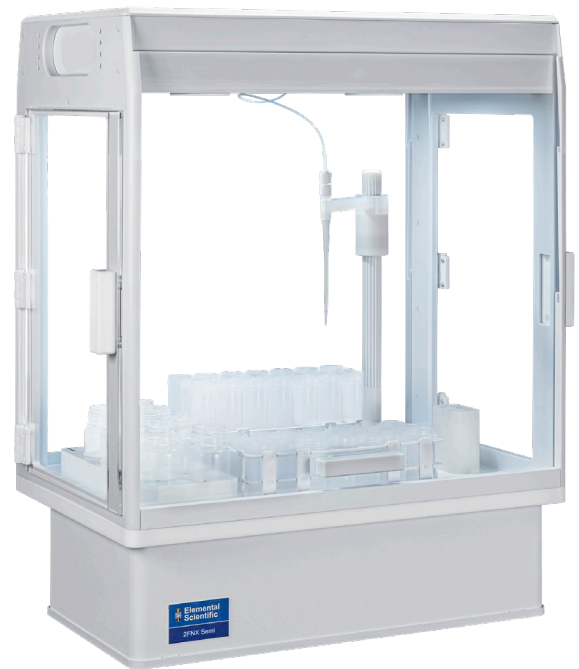
2FNXS Enclosed Autosampler

The ideal enclosed autosampler for high purity labs with low to sub-ppt requirements and/or highly corrosive samples